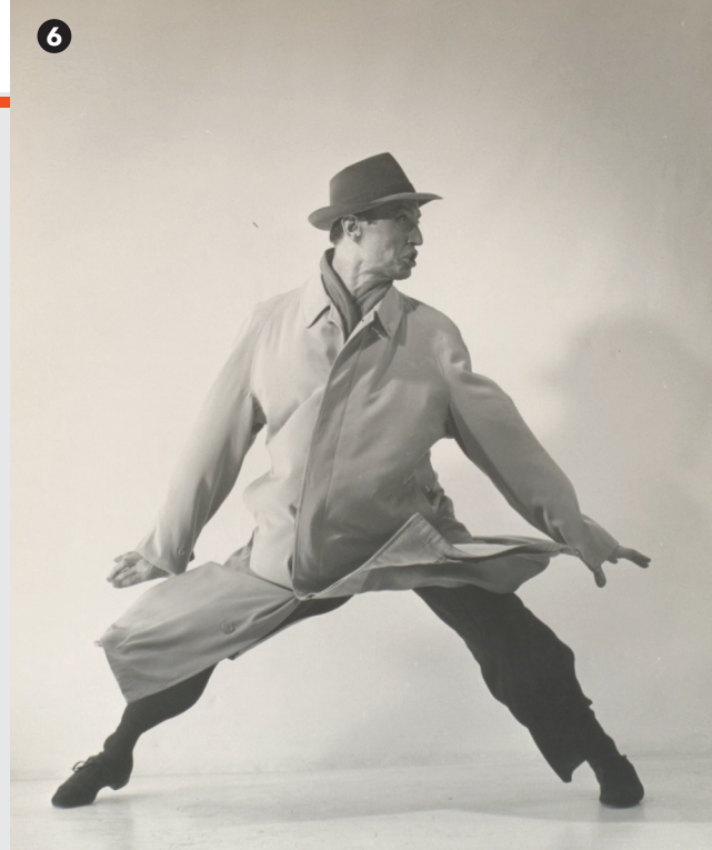
"Man of Action"