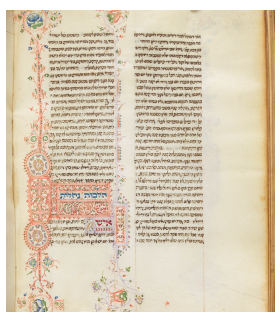
(Add MS 27137, f. 247v)

Unlike Bible, Second Temple Judaism, Talmud, Jewish History, Holocaust, and Israel Studies, there is a lack of academic study of the talmudic and halakhic commentaries and law codes of the medieval and early modern eras. Our understanding of this