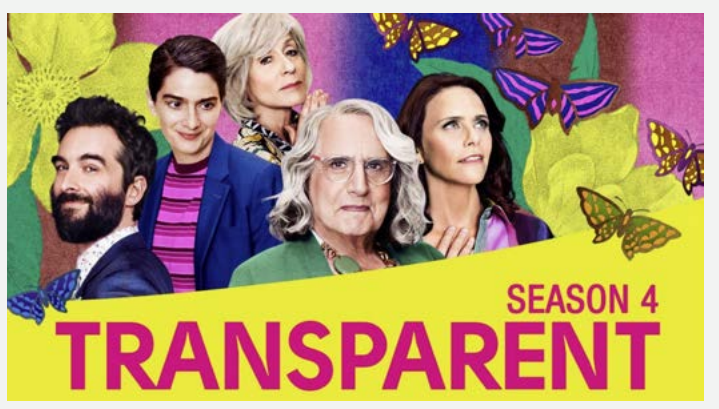
Transparent series poster. Amazon Studios

For education sales contact Abra Filmhouse: abrafilmhouse@gmail.com.