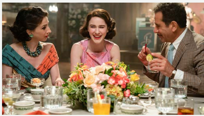
The Marvelous Mrs. Maisel publicity photo.