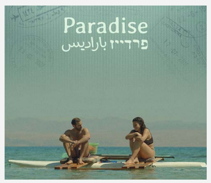
Detail from Paradise movie poster. Abra Filmhouse