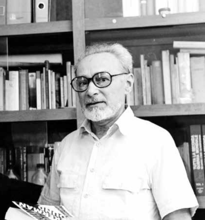
Philip Roth visiting Primo Levi in September 1986 at his home in Turin, Italy.

Before he died, Roth prepared instructions, directions, and even guidelines for his biographer, seeking to control how his story was presented.