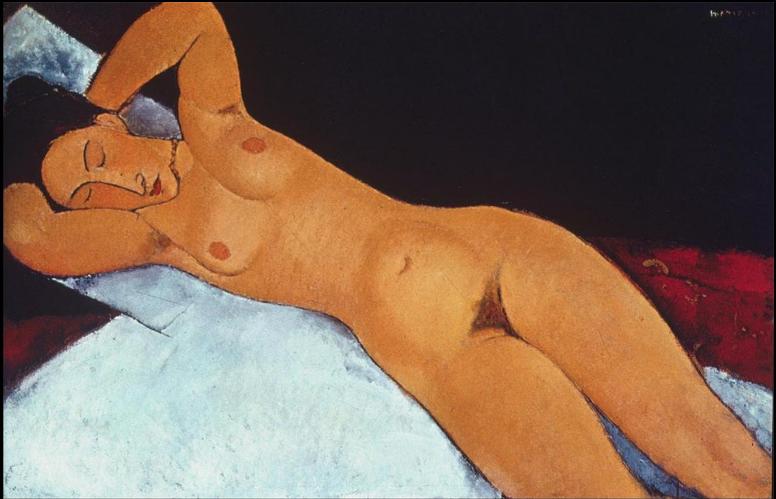
Amedeo Modigliani, Reclining Nude , 1917