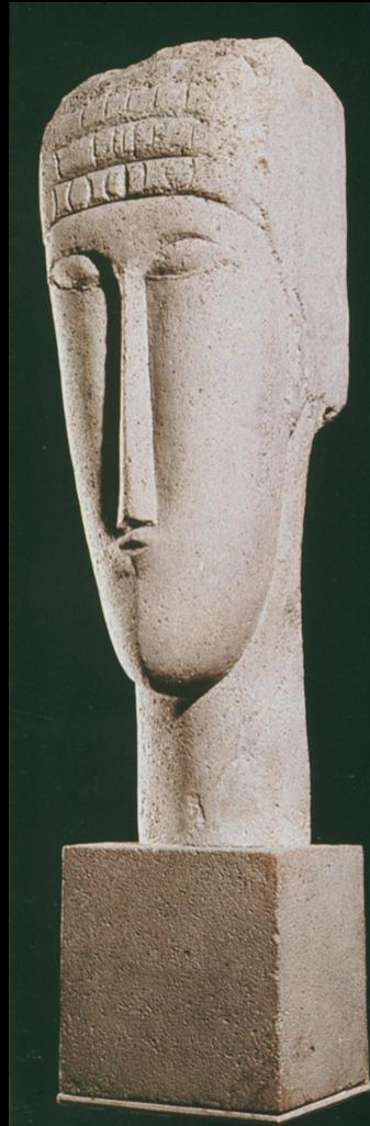
Amedeo Modigliani, Head , c. 1911-13